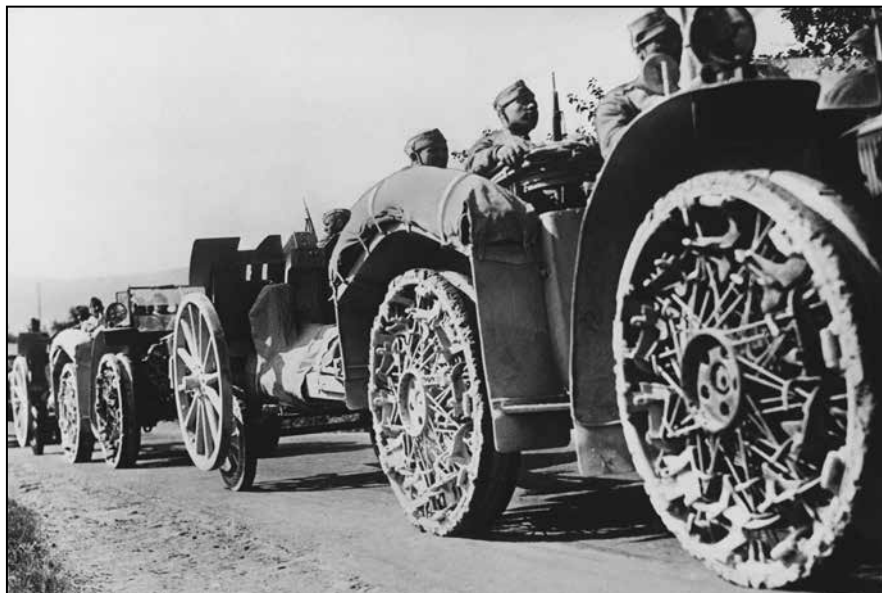
Motorised Italian forces advance into Abyssinia, 1935.